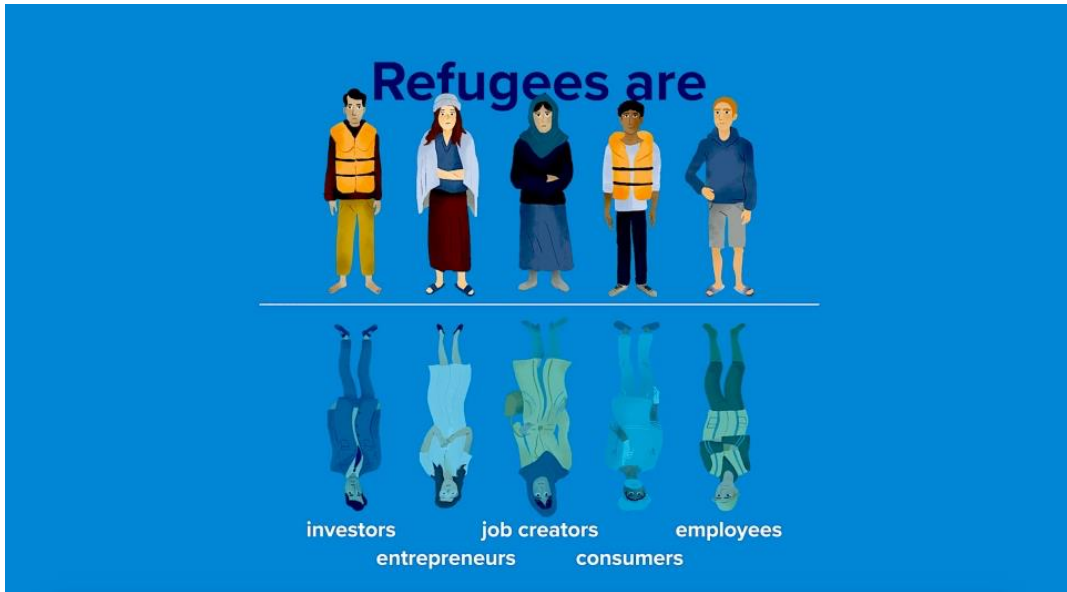
Figure 1: Economic Inclusion of refugees in society

As it was mentioned before, it is believed that refugees are an economic burden to the hosting communities, although they can have a great positive impact. Their economic inclusion is the key to achieving protection and effective integration for refugees benefiting both themselves and the local communities.